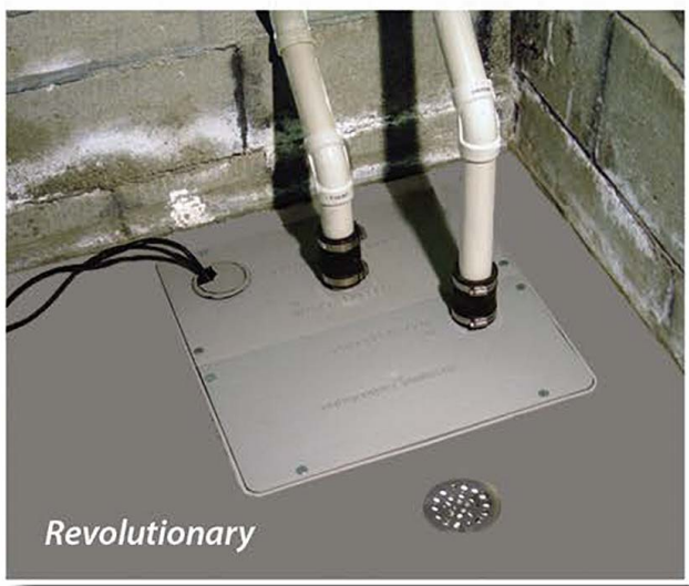
Water Grabber® Bull Dog™ with two pumps and top discharge.