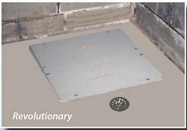
Water Grabber® Bull Dog™ with solid lid, hidden pipes and wires.