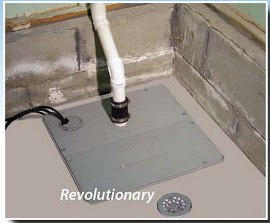
Standard Water Grabber® Bull Dog™ with single pump and top discharge with Ranger™ drain.

Homes are built square, level and plumb ... not circular. Why have a circular pump liner that looks like it houses a pump? Introducing the patent pending Basement Technologies® Water Grabber® Bull Dog™.