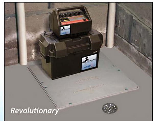
The neat and clean look of the Water Grabber® Bull Dog™ with a Stallion Eliminator Battery Backup, side discharge and Ranger™ drain.